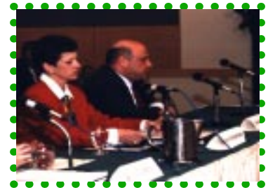
Salt Lake City Testimony

within 50 kilometers of Khamisiyah, Iraq, during the first two weeks of March 1991. That was the period in which an Army engineer unit was demolishing Iraqi ammunition stocks at Khamisiyah — stocks which later turned out to contain chemical weapons. The overall purpose of the survey is: to confirm the location of military units during early March 1991; to identify demolition-related events which individuals may have observed; and to identify health problems which individuals believe may be related to service in the Gulf War.